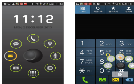
Fig 2. Octopus Launcher

mapped according to the eight possible directions that a joystick can move. To select an application, a user simply moves the joystick in the direction of the application to highlight it. Once highlighted, the user dwells for two seconds to initiate a selection of a target. This highlighting aspect was found to be important to help aid the user in mapping their joystick movement to what they were selecting on the screen. Inside of the application, the user can navigate using the joystick as the cursor interaction. If movement stops, after a slight delay, a sub menu appears with five interaction options; these can include going back, click, menu, scroll, or home.