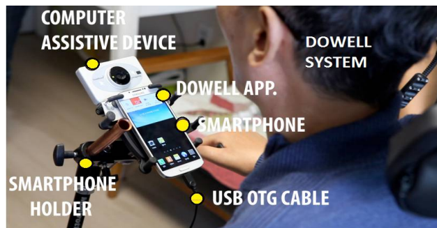
Fig 3. Dowell System